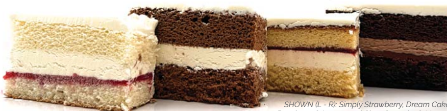
SHOWN (L - R): Simply Strawberry, Dream Cake, Raspberry & Lemon and Choc Ganache & Mousse

Dangerously Addicting! Classic White Cake filled and iced with Coffee Caramel Cream.